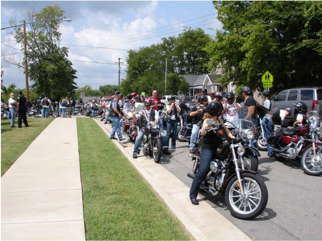
Motorcyclists prepare to leave Bost Harley Davidson for Silverado's at Rivergate.