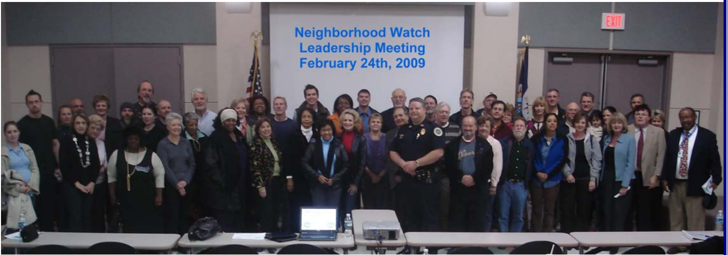
Neighborhood Watch Leadership Meeting