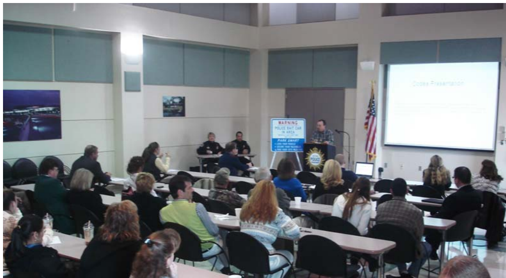
Apartment complex managers gathered at the South Precinct to discuss issues and concerns