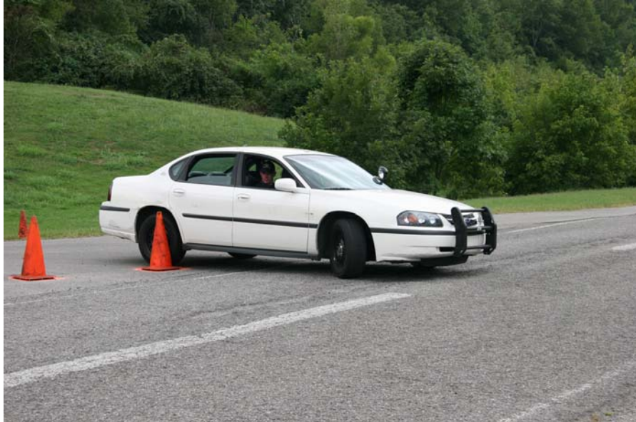
Members of Session 58 practice driving skills during Emergency Vehicle Operator Course training.