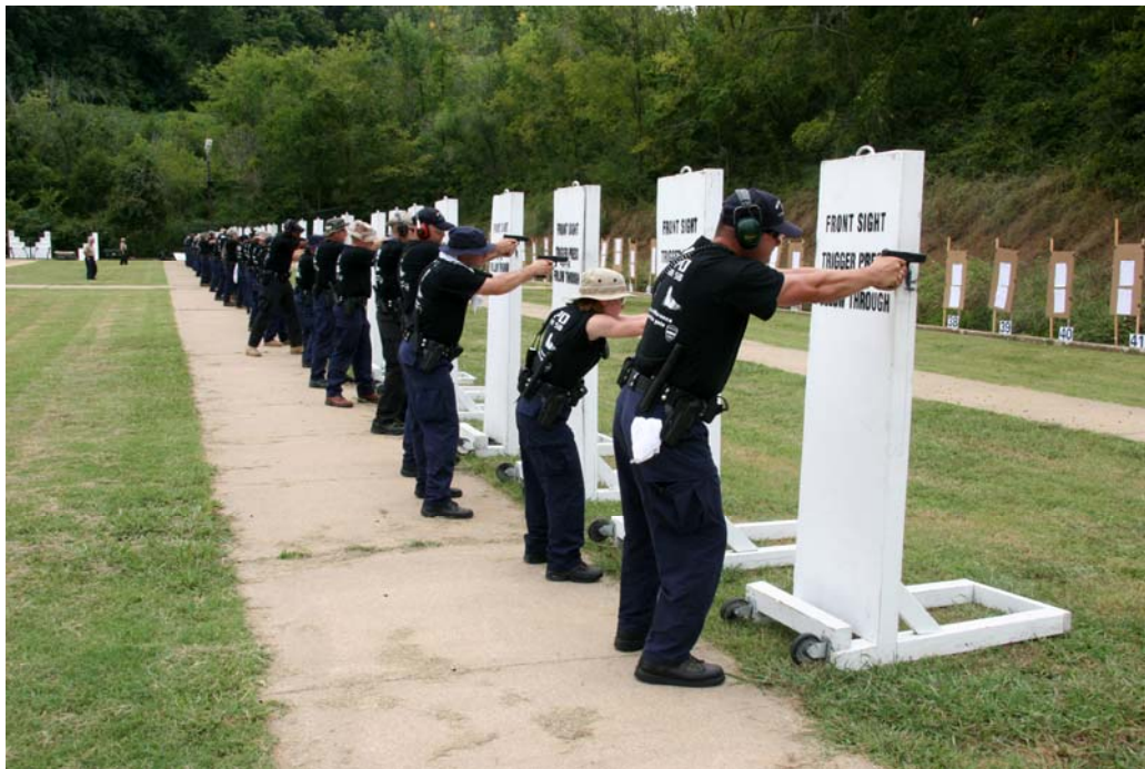
Session 58 Firearms Training.

Please join us for Session 58 graduation ceremonies November 3 at 6 p.m. Christ Church Nashville 15354 Old Hickory Boulevard