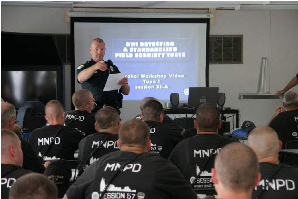
Session 57 receive instruction on DWI detection and field sobriety testing.