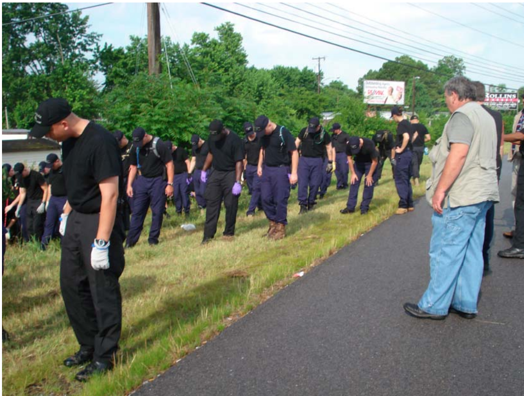
Members of Session 58 assist North Precinct Detectives with an article search.