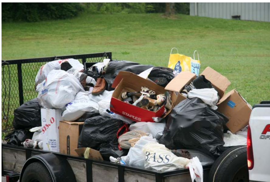
The MNPD collect over 6,000 pairs of shoes for Souls for Soles

Also, over 6,000 pairs of shoes were collected by the department during the Souls for Soles shoe drive. Thanks to all who participated!