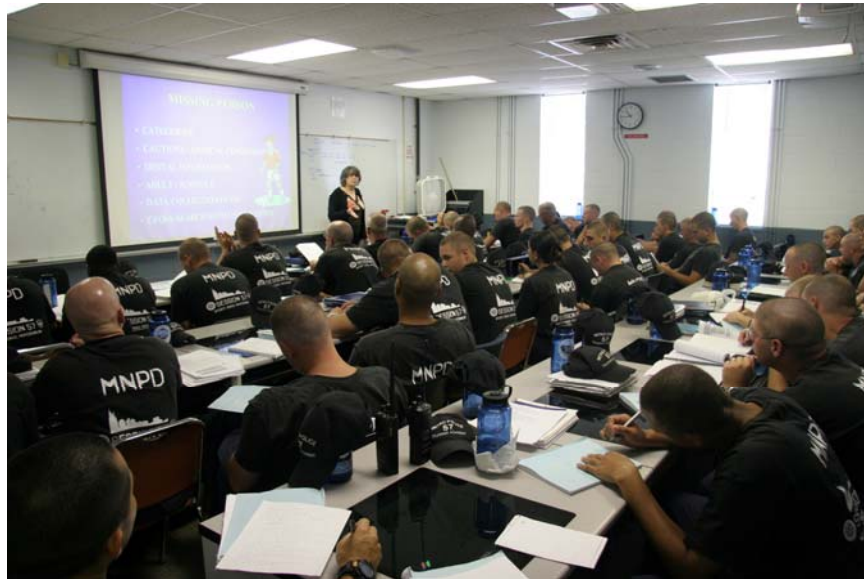
Session 57 NCIC certification

Session 57 graduation ceremonies are scheduled for July 17 at Tusculum Hills Baptist Church at 6 p.m.