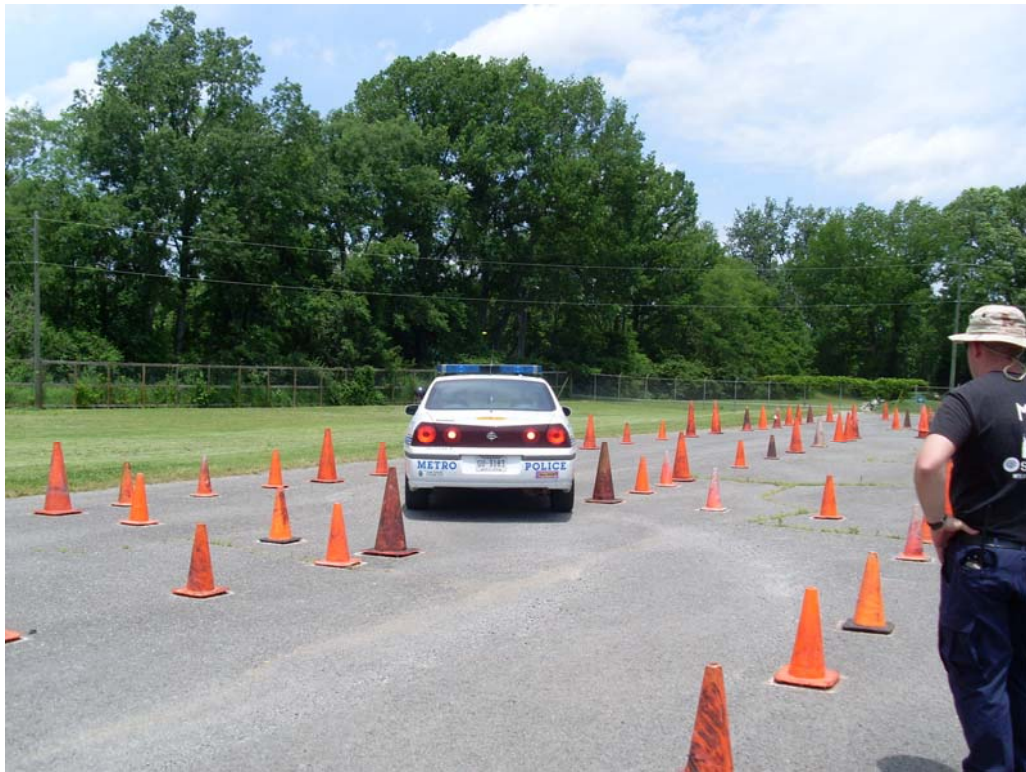
Session 57 completed their emergency vehicle operation training this week. They are in week 17