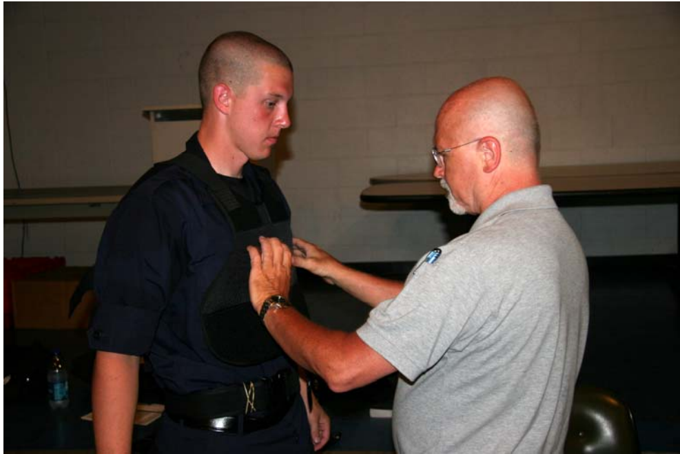
Members of Session 58 were fitted for their body armor this week. They are in week 2.