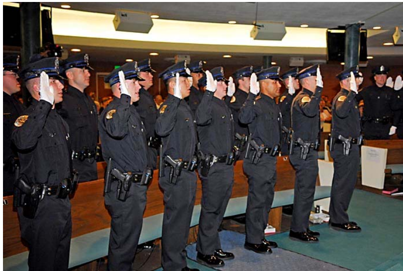
Session 56 takes the oath of office.