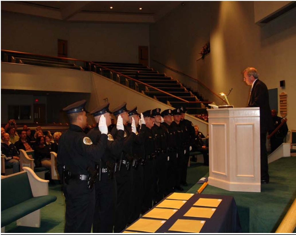
Mayor Bill Purcell administers the police officer's oath to members of Session 52.

In January, I sent word that strong efforts were underway to bring a net increase in manpower. I am tremendously grateful to the recruiting and training staffs for their hard work in helping this department employ outstanding men and women who aspire to work alongside such fine law enforcement professionals as you.