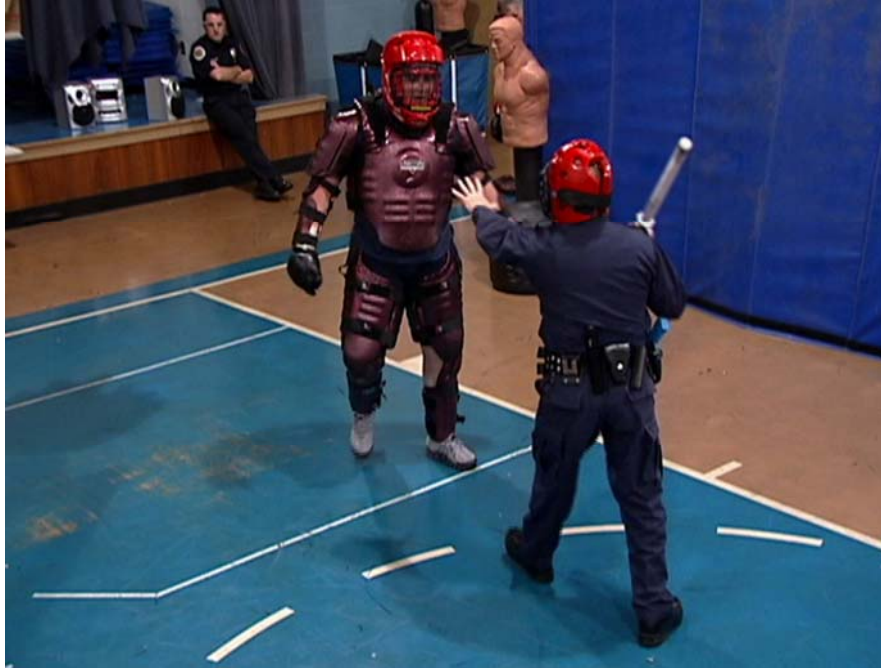
BOX DRILL: Session 52 participating in defensive tactics training.